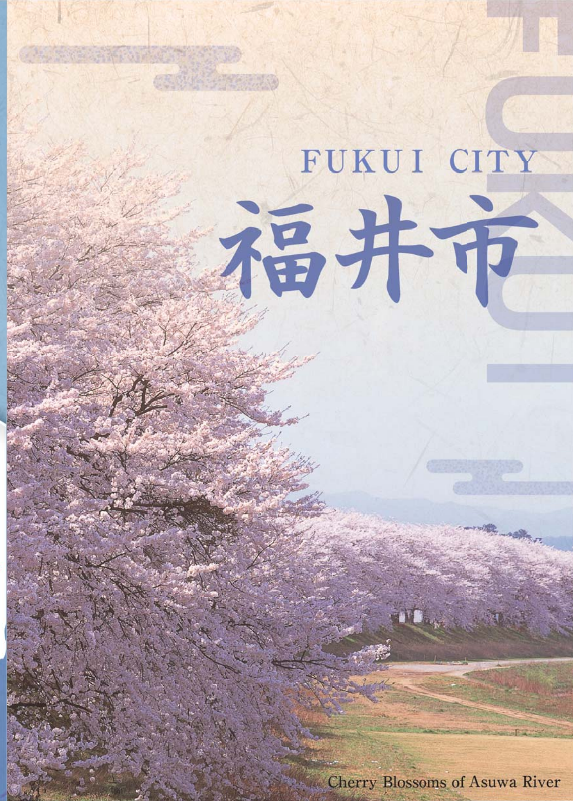
Cherry Blossoms of Asuwa River